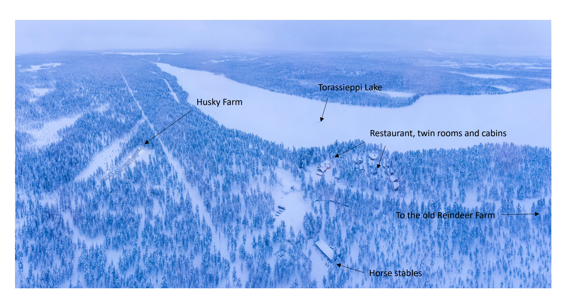
Aerial view of Torassieppi